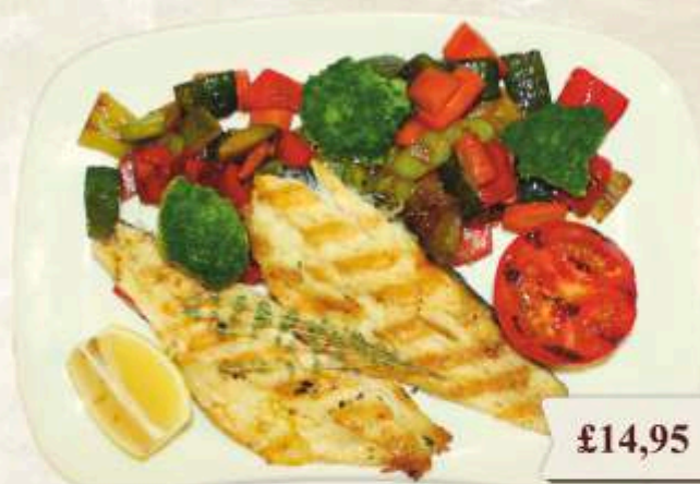
Grilled Salmon fillet fresh grilled salmon fillet served with chips