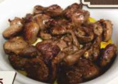
Chicken hearts with butter