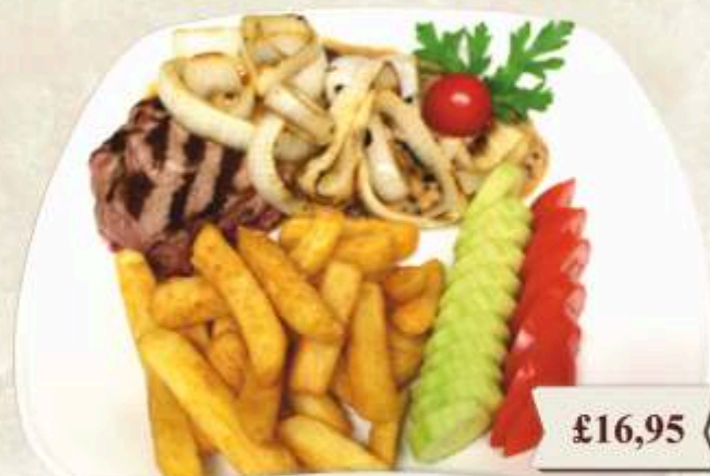
Sirloin steak served with chips & salad