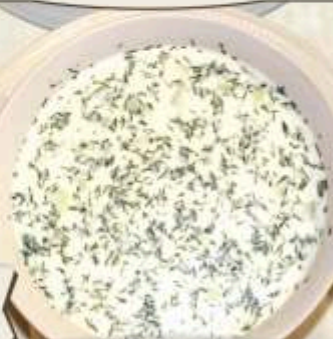
Summer Soup / tarator (served cold) yogurt soup with cucumber, dill, garlic and walnuts