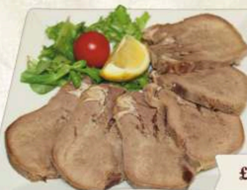
Sliced Beef tongue with butter