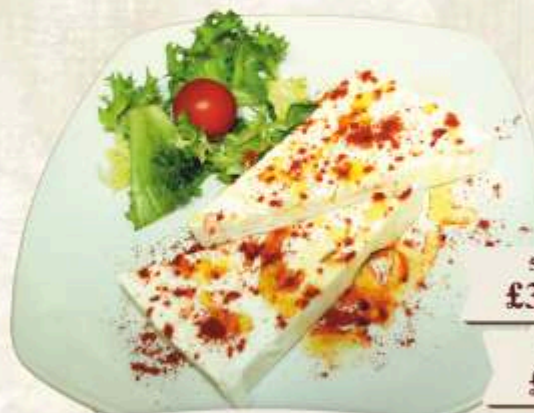
Mixed cold appetizers