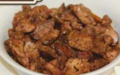
Chicken liver with butter