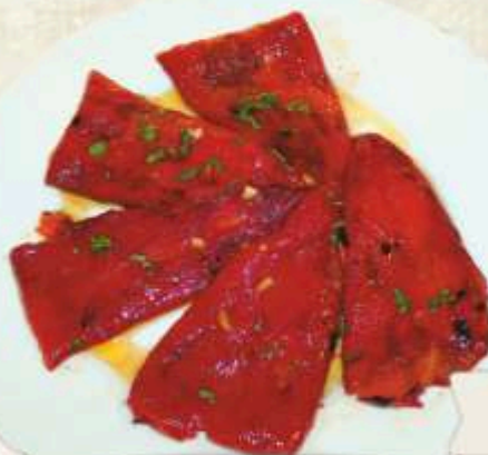
Pickles homemade mix of pickled vegetables